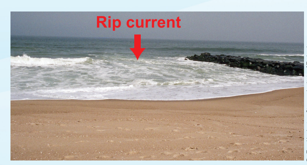
Rip currents often form near coastal structures.