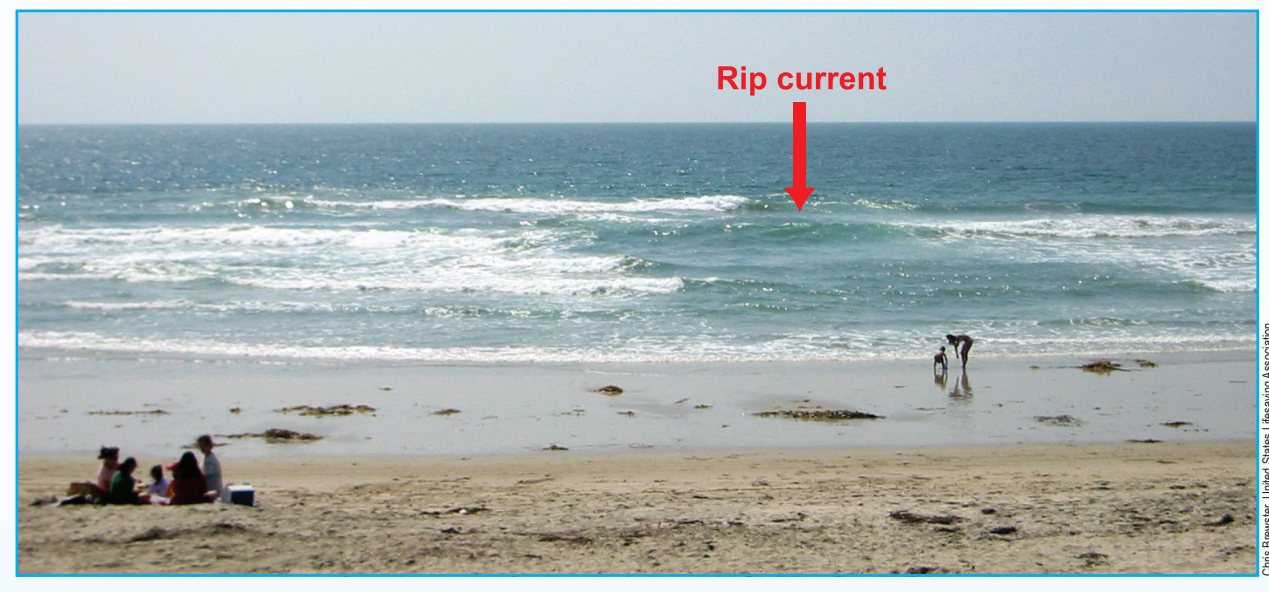
A break in the incoming wave pattern is one sign of a rip current.