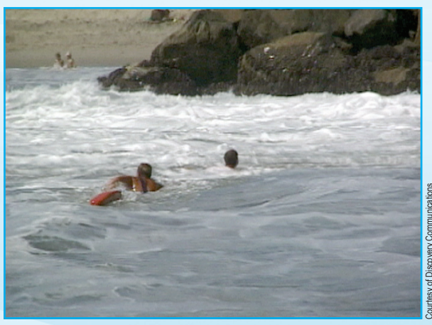
A lifeguard rescues a swimmer caught in a rip current.

P CURRENTS BREAK THE GRIP OF THE RIP <mark>RIP CURRENTS</mark> BREAK THE GRIP OF THE RIP <mark>RIP CURRENTS</mark> BREAK THE GRIP OF THE