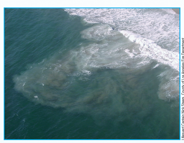
Rip currents often generate a plume of sediment moving away from shore.